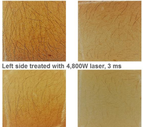
Fig. 2. Example of hair removal results: subject 8 with skin type III and brown hair treated on the arms; the hair count shows an improvement of 18% when using 4,800W.

Right side treated with 1,000W laser, 10/14 ms